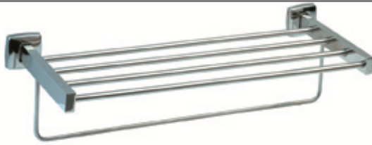
AI0710C Bright finish