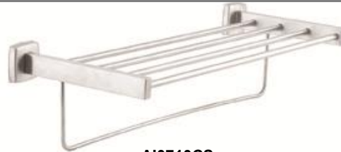
AI0710CS Satin finish